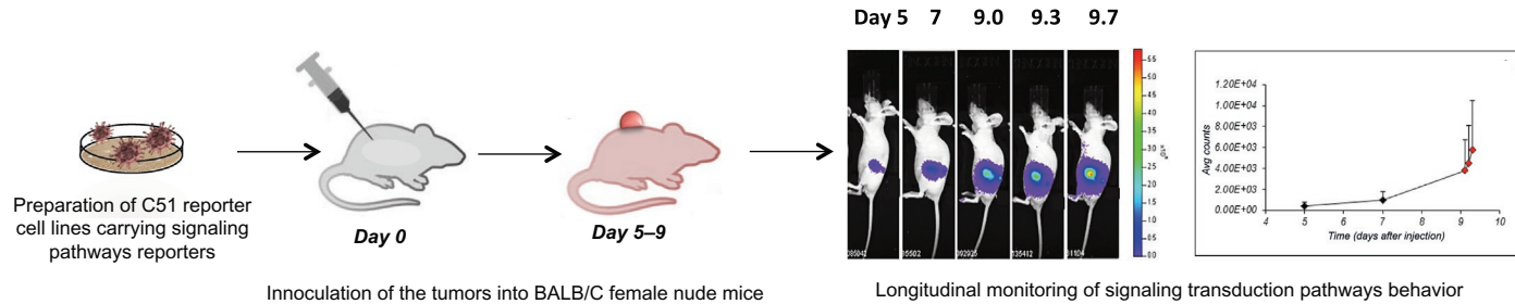
Figure 3 Longitudinal monitoring of signaling transduction pathways behavior within growing tumors. Mouse colon carcinoma cell lines are initially transduced with signaling pathways reporters and used for the inoculation of subcutaneous tumors in nude mice. Within the range of 15 days, in vivo bioluminescence measurement of signaling pathway behavior is monitored in anesthetized mice after injection of luciferin substrate.